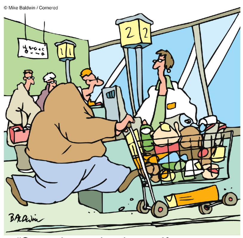
"Sorry, I went bankrupt. If you want payment you'll have to get in line like everybody else."