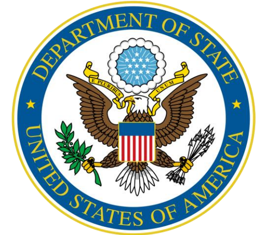
Department of State

U.S. Citizenship & Immigration Services (USCIS) Customs & Border Protection (CBP) Immigration & Customs Enforcement (ICE)