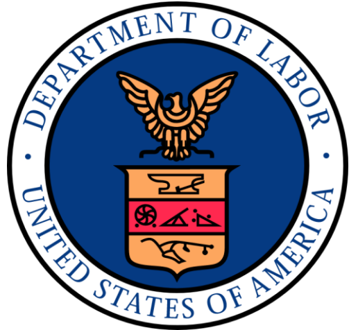
Department of Labor